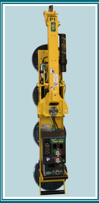
P110T04DC3 600 lbs [270 kg]