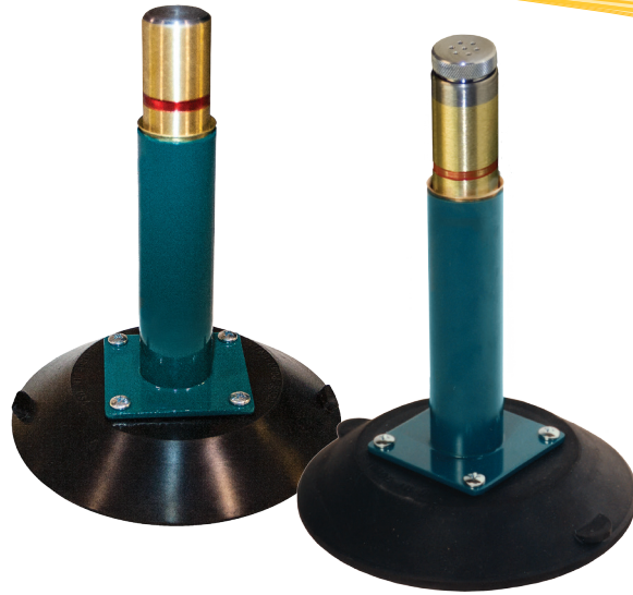
LJ6VH, LJ6VHWBP VERTICAL HANDLE HAND CUPS

THE ORIGINAL & TRUSTED NAME IN VACUUM LIFTING EQUIPMENT