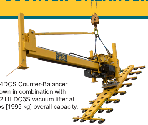
CB4DCS Counter-Balancer shown in combination with PRT3211LDC3S vacuum lifter at 4400 lbs [1995 kg] overall capacity.

Designed for use with a crane or other hoisting equipment, the CB4DCS Counter-Balancer accommodates load handling under overhangs by utilizing an adjustable-position counterweight to balance a WPG vacuum lifter, whether loaded or unloaded.