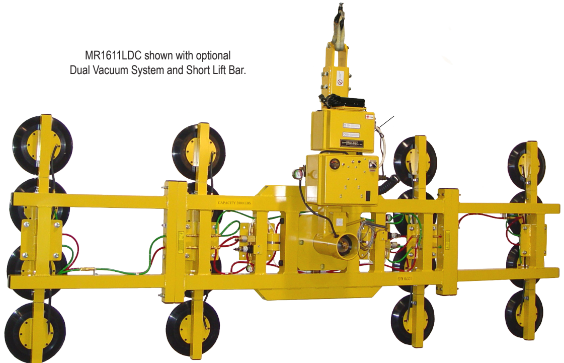
MR1611LDC shown with optional Dual Vacuum System and Short Lift Bar.

908 West Main - P.O. Box 368 Laurel, Montana 59044 U.S.A. 406.628.8231 (phone) 406.628.8354 (fax)